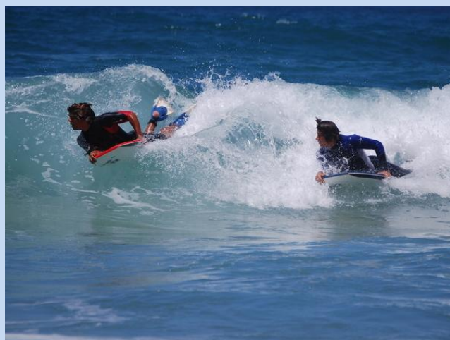
"LA CALA DE MIJAS" BEACH