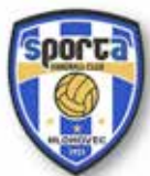
Sporta Hlohovec (SVK)

Hungarian league: 3rd place 2012/13, promotion 2007/08