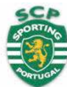
Sporting CP (POR)